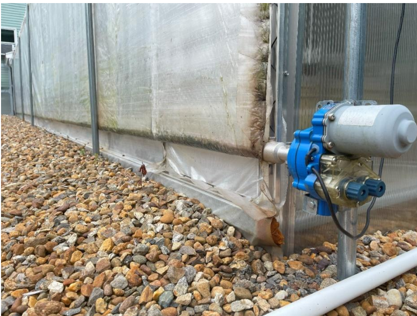
Figure 5. Side wall passing apron during closure to create seal.