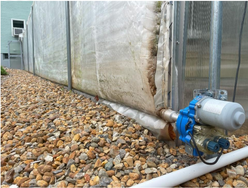
Figure 6. Fully closed side wall with rail seated along base of wall forming its maximum seal.