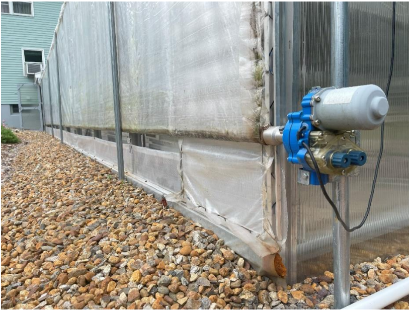
Figure 4. Roll up side wall showing 12" apron at base of wall providing a seal at closure.

Terrific, I got my natural ventilation and was able to afford automated roll up side walls. That's the thumb up side of the compromise. What I experienced during the first heating season showed me a thumb down side to the decision. Let's make sure this doesn't sound like a complaint, it's not. Instead, let's discuss limitations that compromise brings. In this case, I observed three limitations in my roll up side walls. First was a less than permanent, by design, seal along the bottom edge of the side wall where the roll up pipe seats against the bottom of a 12 inch apron shown in Figures 4-7.