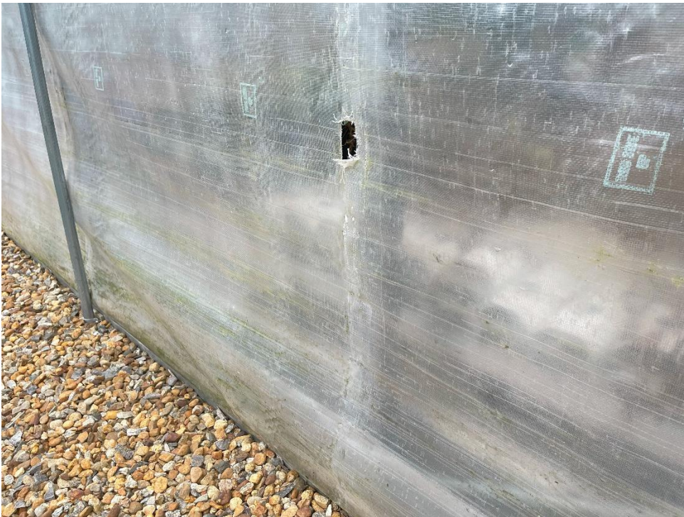
Figure 8. Fabric hole caused by friction during opening/closing of side wall. Note vertical guide rail to left.

Following my first heating season with the new house and observing the limitations described in these images I decided to insulate the side walls before the second heating season. The first iteration was hanging a single layer of poly inside the wall which could be bunched up and tied at the top to allow for summer ventilation. This worked okay and evolved into something more permanent before my third heating season. I installed twin wall polycarbonate on the inside that is easily installed and removed seasonally. The project will be presented in pictures in a future chapter of this sgaft.com series. For now I'll simply state...issue addressed.